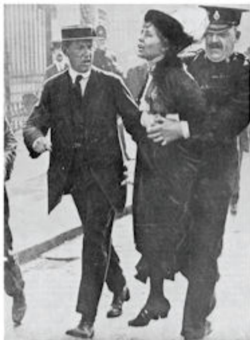
Emmeline Pankhurst is escorted at a protest outside Buckingham Palace. Her tactics for drawing attention to the suffrage cause led her to prison several times.

For the militants, the image of the woman chained to the railings or carried off by the police was designed to shock audiences of readers and viewers and galvanise their support.