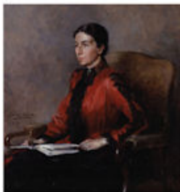
Portrait Mrs Humphry Ward by John Russell Gray 1895

In 1910 the NLOWS was formed by amalgamating two smaller 'anti' groups. Its figure-head was author of popular novels Mrs Humphry Ward (1851-1920). At first a cause for dismay among suffragists, opposition proved a blessing in disguise. It exposed the feebleness of the argument against women's suffrage.