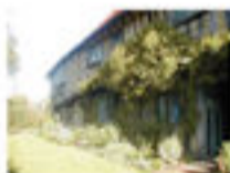
Ellen Terry's home at Smallhythe in Kent, now owned by The National Trust.

'By your leave, Nance Oldfield does her talking for herself! If you, Sir Prejudice had had your way, There would be never an actress on the boards... The stage would be as dull as now 'tis merry - No Oldfield, Woffington - or Ellen Terry!'