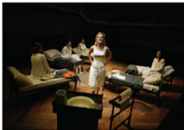
Diana of Dobson's produced at the Orange Tree Theatre, Richmond in 2007.

Cicely also spoke at rallies and published widely on suffrage topics. Like her novel Marriage as Trade , her play Diana of Dobson's , staged in 1908, dealt with the economic options open to women.