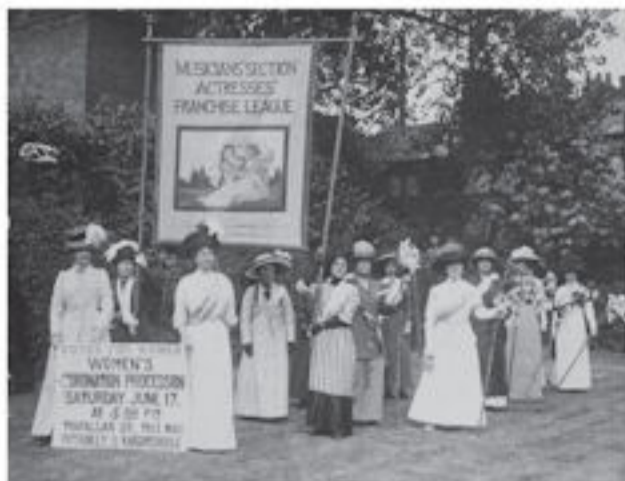
Part of the 1911 costumes of the Women's Pantomime in June 1911.