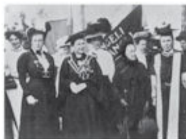
Leaders of the Suffrage Society Movement in the WSPU. Left to right: Lady Frances Balfour, Millicent Fawcett, Ethel Snowden, Emily Davies and Dr Sophia Bryant. Members of the Women's Social and Political Union.

Lady Frances became President of the London Society for Women's Suffrage and of its branch in Richmond. Blessed with an excellent platform voice, she attended events and rallies throughout the borough.