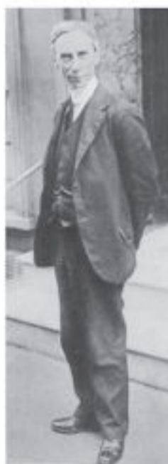
Home Office photograph of Bertrand Russell, 1914.

In 1907, the philosopher and Richmond resident Bertrand Russell unsuccessfully stood for election on a Women's Suffrage platform at the Wimbledon Parliamentary by-election. His wife contributed an entry to the Suffrage Cook Book on how to preserve a good suffrage speaker. He remained an outspoken social critic, and was the founding President of the Campaign for Nuclear Disarmament in 1958.