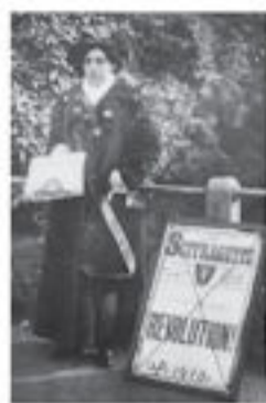
Princess Sophia Duleep Singh holding the suffrage banner at Hampton Court Palace, where she had a suite of apartments.

The daughter of a Maharajah exiled from the Punjab, she lived in a grace and favour apartment at Faraday House, Hampton Court which was provided by her godmother, Queen Victoria.