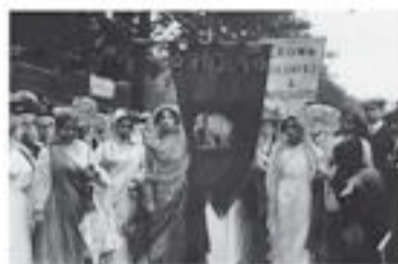
Indian suffragists taking part in the Women's Liberation Procession in June 1911.

Women were often dressed in white, with purple, white and green sashes. They marched under embroidered banners, with drum and fife bands, in groups from all over the country.