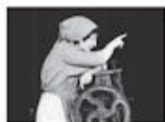
In the Workhouse , from a series of 10 plays.