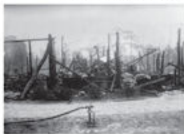
New Scotland Yard after it was burnt down.

By 1913 this had escalated to destroying mail in letterboxes and arson attacks on unoccupied buildings. All targets were chosen to avoid endangering life.