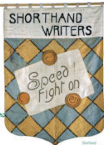
SHORTHAND WRITERS banner.