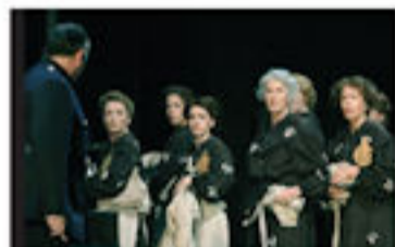
Her Naked Skin , from a series of 10 plays.

In 2008 Rebecca Lenkiewicz's Her Naked Skin , produced by the National Theatre, dealt with the suffragettes and their imprisonment in Holloway, and explored this country's shameful history by showing on stage the cruelty of the government's forcible feeding programme.