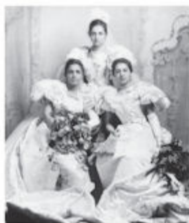
Princess Catherine, Bertha & Sophia Duleep Singh, at their presentation at court, c.1905.

person for the purposes of representation, why should I be a fit person for taxation?" When bailiffs seized jewellery to cover the debt, suffrage supporters bought it back at auction, using the event to gain publicity for the cause.