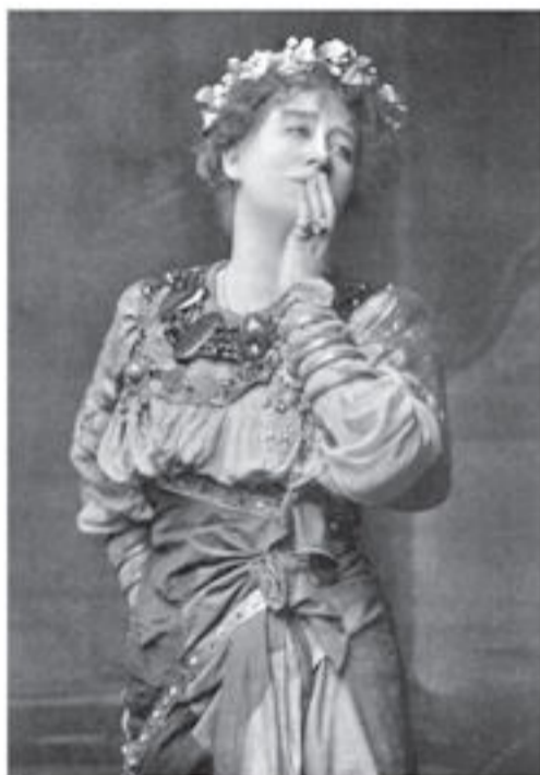
Ellen Terry as thought in Shakespeare's Coriolanus .